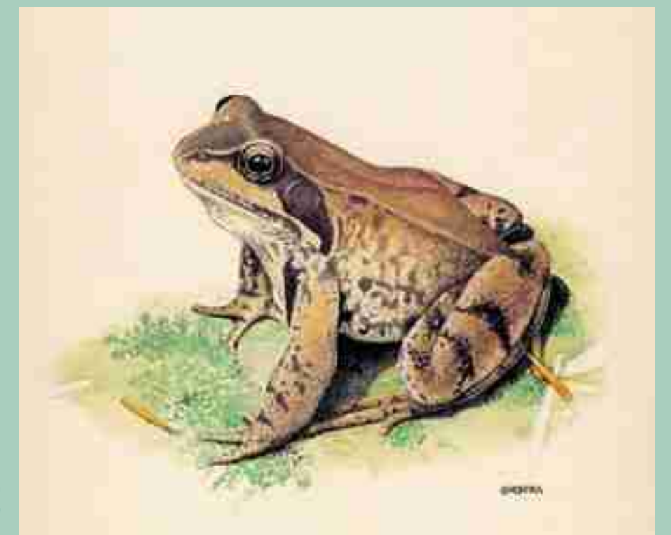
Grass frog ( Rana temporaria ) Jordi Corbera, 1999 Gouache, 42 x 30 cm