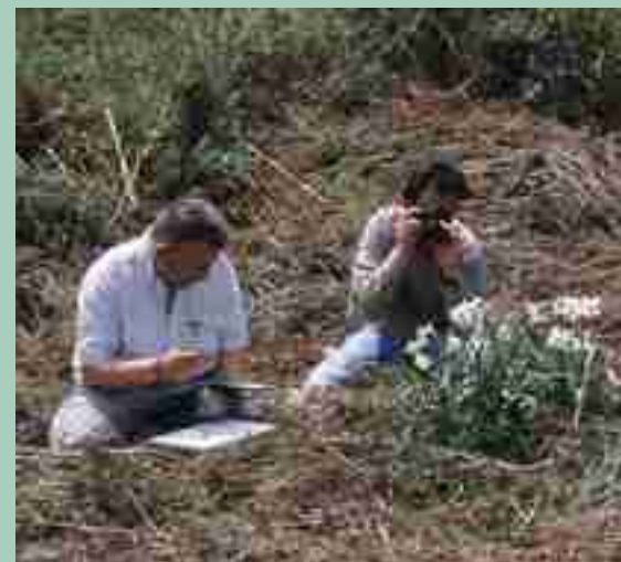
The authors working at field near Sta Fè del Montseny