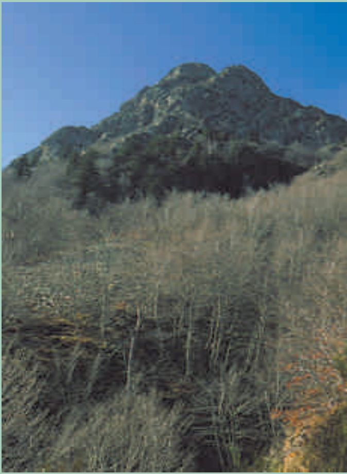
Winter view of north side of the Agudes (Montseny N.P.). We can see at the bottom the beech forest while the silver firs ( Abies alba ) remain near the summit as a testimony to a time when the climate of Montseny was colder.

2 Carrer Major 148. E-08470 Sant Celoni, Spain. E-mail: cpuche@retemail.es