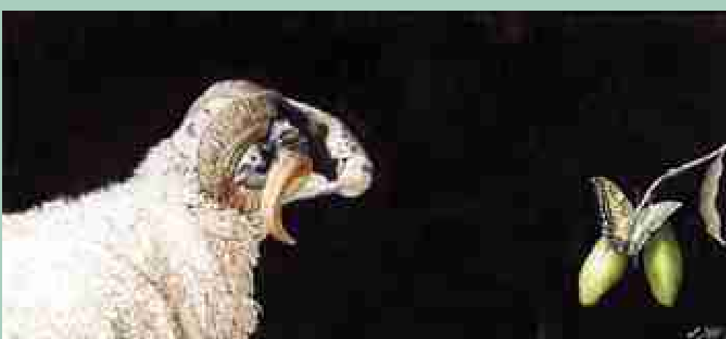
"The leisurely ram", Eduardo Saiz, 1999 Watercolour, 37 x 17 cm