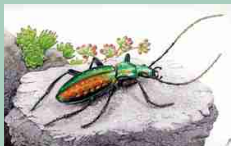
Carabus rutilans , Amadeu Blasco, 1999 Watercolour and gouache, 38 x 36 cm