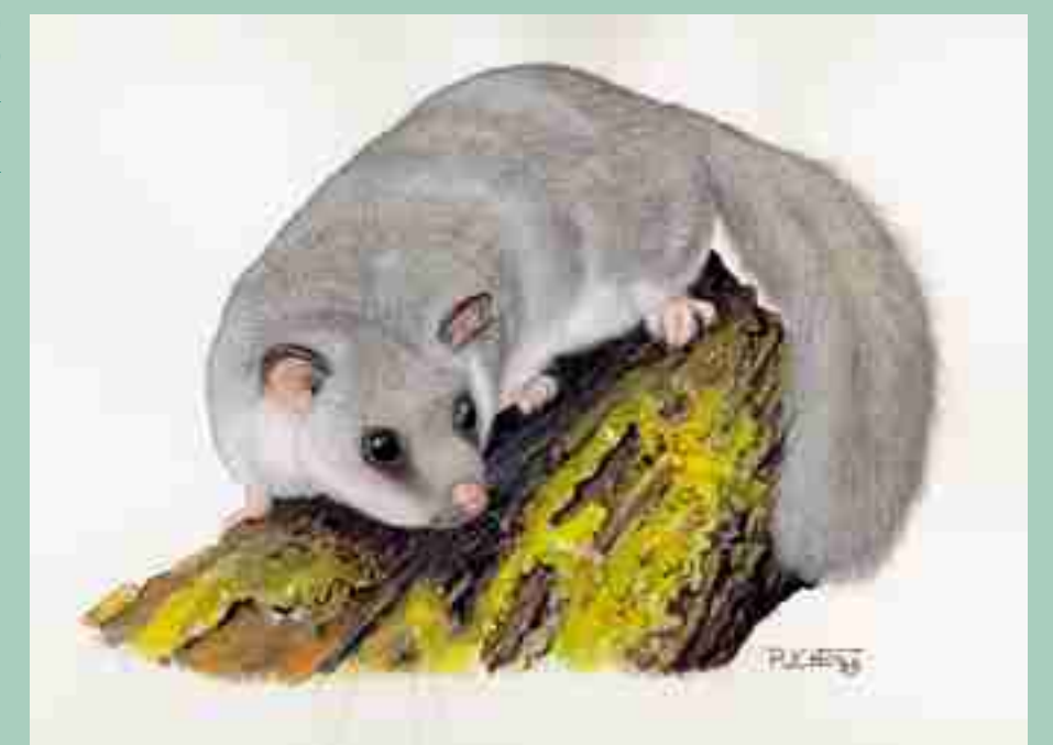
Dormouse ( Glis glis ) Carles Puche, 1999 Watercolour and pencil, 38 x 36 cm